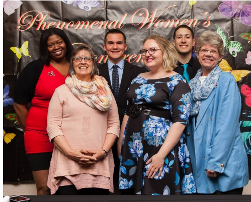
The Siegel Institute staff at the 15th Annual Phenomenal Women's Conference!