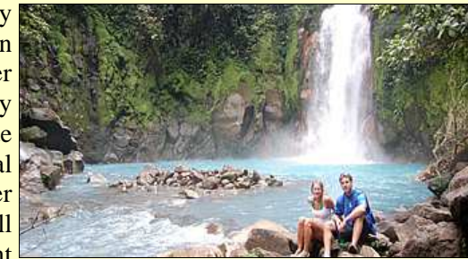
Rio Celeste (Light Blue River) waterfall in Costa Rica